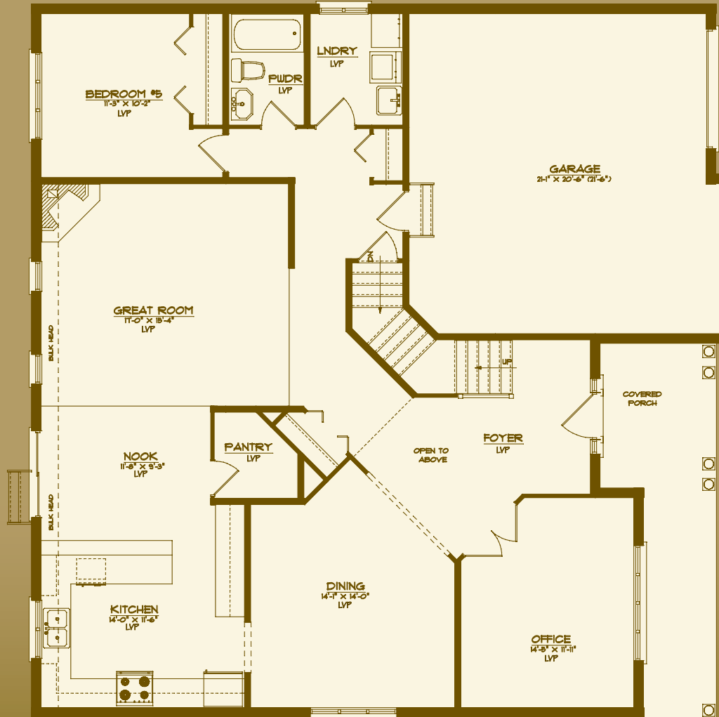
Main Floor 1,691 Sq. Ft.